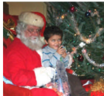
Santa at Lithuanian Post 154 Children's Christmas Party.

The annual Lithuanian Post 154 Children's Christmas Party was held at Lithuanian Hall on Sunday, December 12th. This event has been a Post tradition for over 50 years.