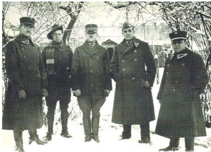
Members of the Lithuanian American Brigade in Kaunas, Lithuania 1920.

The Japanese attack on Pearl Harbor on December 7, 1941 quickly changed the independent way of thinking by Lithuanian Americans veterans. Although all the Legion members continued to be very proud of their ancestral heritage, they were Americans first and foremost. As a result, these Lithuanian American Legion post members immediately gathered