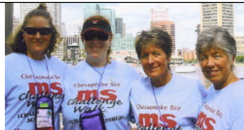
Team Viltis - 2006

And so, for the third year now, Team Viltis is accepting the challenge to participate in the Chesapeake Bay MS Challenge Walk to help raise funds that will be instrumental in helping and changing the future for all those living and struggling with MS. The Challenge Walk will take place September 15 and 16, 2007. Our team will join hundreds of others in a 50K walk from Baltimore to Annapolis. Monies raised during this event directly support the