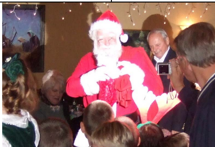
Excited children greet Santa as he arrives at the Lithuanian Post 154 sponsored Children's Christmas Party at Lithuanian Hall.