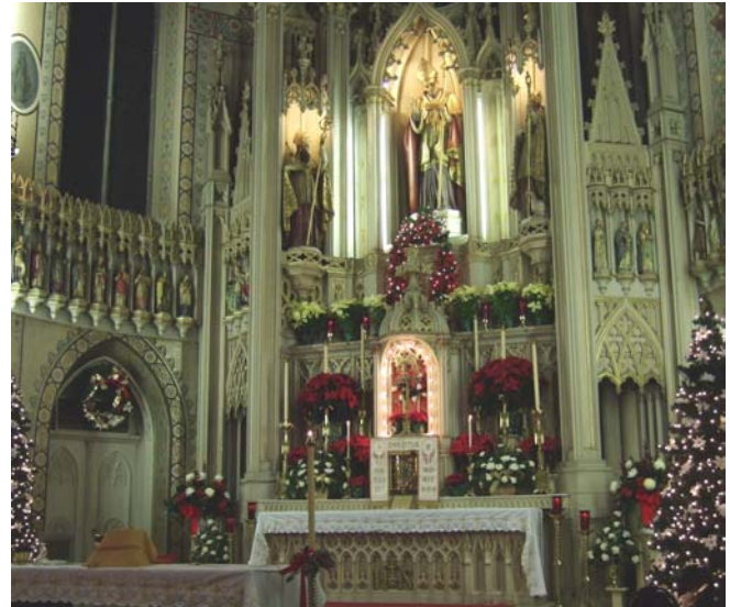
St. Alphonsus Church

Fourteen members of Lithuanian Post 154 attended the annual "Back to God Mass" service at St. Alphonsus Church in downtown Baltimore on November 2nd. Though fourteen attendees out of a post with ninety-eight members does not seem like a good turnout, it is actually very good considering the unique membership profile of Lithuanian Post 154. Though the Post meets at the Lithuanian Hall in Baltimore, only twenty-one members live in Baltimore. Twenty nine members live out of state and the remainder are scattered throughout Maryland from Ocean City to Westminster. Most members are of Lithuanian descent or grew up close to Lithuanian Hall and choose to retain relationships with their old neighborhood by belonging to Lithuanian Post 154. Considering where our members live, 14 was a good showing.