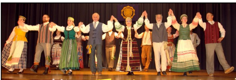
Malunas Lithuanian Folk Dance Group

This Installation of Officers Ceremony would not be possible without the hard work of the many Legionnaires and volunteers who helped make it a success. All the work was done by volunteers, nobody was paid.