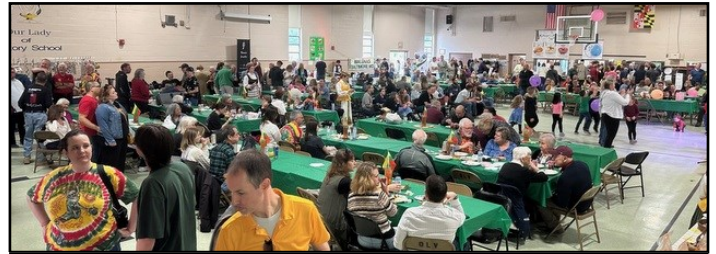
Attendees browsing vendor tables, dancing, eating delicious Lithuanian food and socializing while sipping on Lithuanian drinks.

Lithuanian Post 154 will have a visitor Hospitality Suite at Bradley on the Bay Condominium, building A, unit 304, 3901 Ocean Highway. If you are in Ocean City and wish to visit, contact Vincent Dulys (410) 960-7874 prior to walking 3 flights of stairs to be certain Hospitality Suite is open.