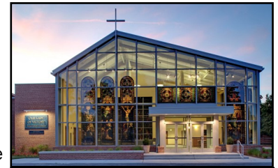
Our Lady of Victory Church